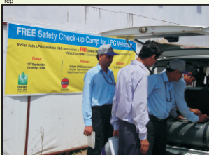
IAC organized LPG Kit Safety Check up camp at IOC LPG Station in New Delhi on Sep. 10, 2006.