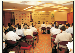
More than 75 Delegates participated in the Conference