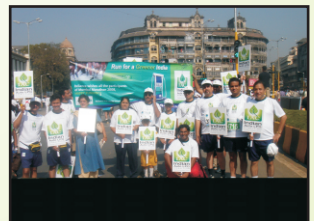
IAC Contingent at Mumbai Marathon 2008