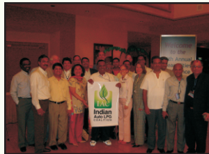
Complete Indian delegation with US Department of Energy team at Clean Cities International conference in Palm Springs, California, in May 2005