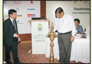
Shri S.K. Dash - Joint Secretary, Ministry of Road Transport & Highways, Inaugurating the seminar by lighting a lamp