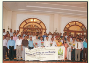
IAC Organized Seminar on Inspection & Safety in Aurangabad on July 28, 2007