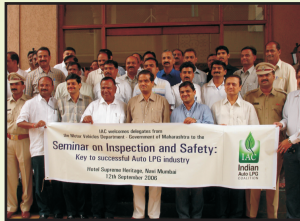
IAC organized Seminar on Inspection and Safety in Mumbai on Sep 12, 2006