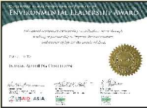
ENVIRONMENTAL LEADERSHIP AWARD