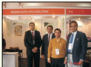
IAC Delegation at Auto Expo 2008