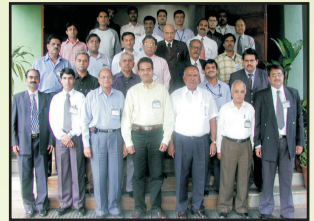
IAC organized Workshop at ARAI Pune in 2006