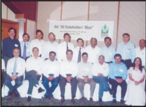
Fourth All Stakeholder meet at Mumbai in September 2006