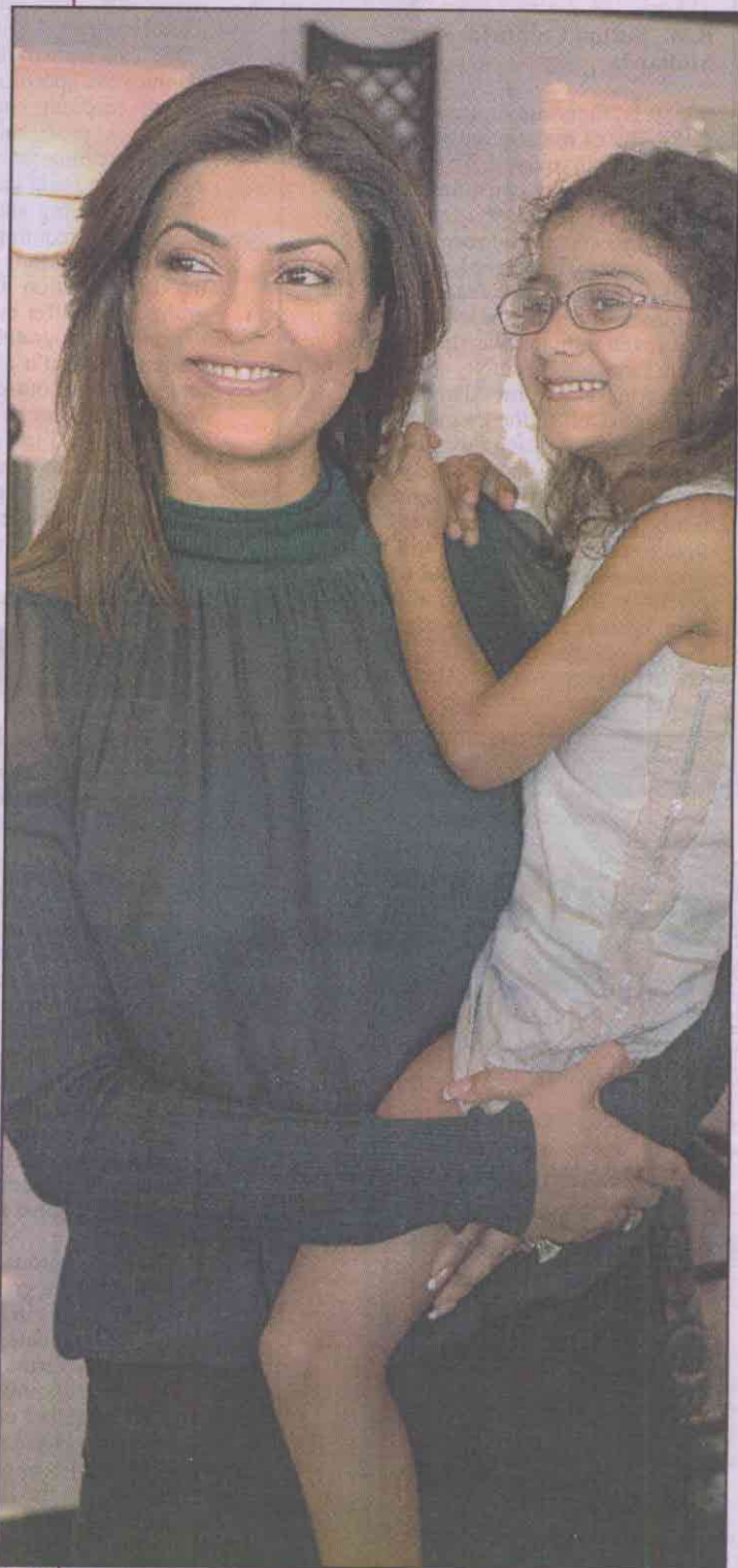
PICTURE PERFECT: Bollywood actress Sushmita Sen along with her daughter Renee pose for The Asian Age .

Currently, most petrol driven cars with the Euro 2 standardisation can be fitted with LPG kits. Mumbai has around 10,000 cars that have been fitted with these kits.